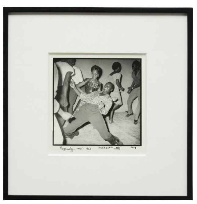
Malick Sidibé. Regardez-Moi, 1962/2007; silver gelatin print.

Mali has a long, rich musical heritage fundamental to its culture. Traditional Malian musicians were considered the "keepers of memory," responsible for passing stories down through the generations. The country today is internationally renowned for its musical production, an expansive flowering of which began during the era Sidibé was documenting. His photographs take on still greater potency in the wake of 2013, when Islamic militants attempted to ban music in northern Mali altogether.[2] Live-music venues were shut down, local musicians thrown into exile, and instruments set afire. The world-famous Festival in the Desert was moved to Burkina Faso and then postponed altogether because of security risk. French and Malian forces disarmed the militants early in 2013, but the northern region remains contentious territory. While there are many theories on the motivations behind the attempted music ban, the endeavor itself underscores the threat that music and art can pose to political extremism. The stolen freedoms archived in Sidibé's work become all the more precious in a time when this freedom has been imperiled. In addition to recording a specific moment in which a globalized Malian youth culture came into being, the images become testament to the centrality and sacredness of music in Malian society.