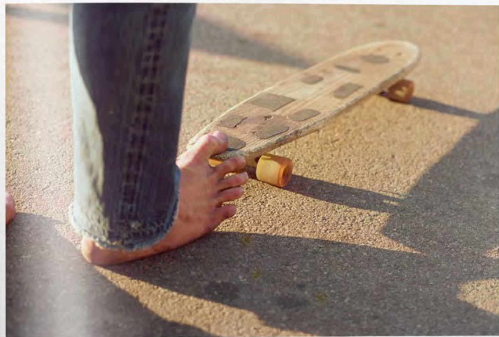
HANG ONE, BURBANK (NO. 84), 1975 CHROMOGENIC PRINT