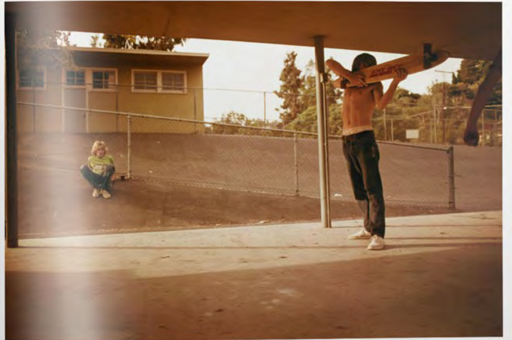
SKATE SHOOTER, KENTER CANYON, 1976 CHROMOGENIC PRINT