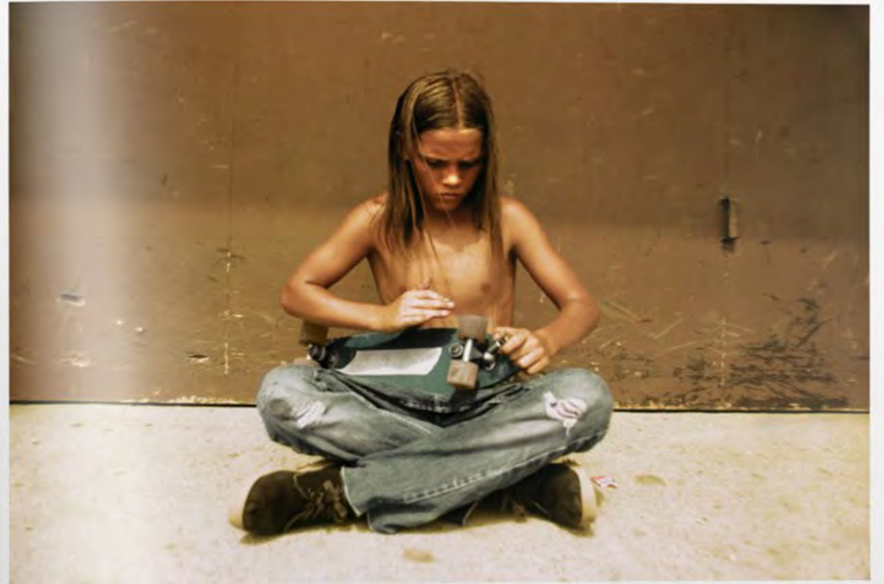
SIDEWALK SURFER PIT STOP, HUNTINGTON BEACH (NO. 70), 1975 CHROMOGENIC PRINT