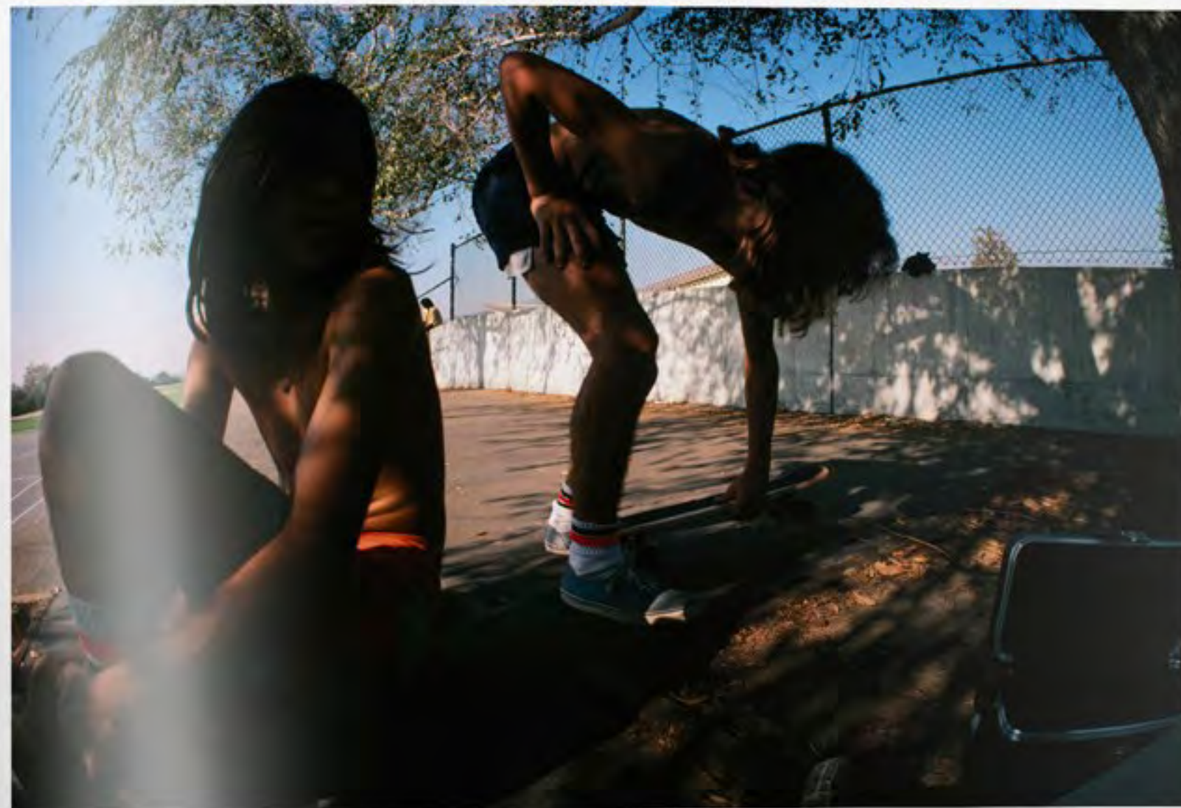
IN THE SHADE, 1976 CHROMOGENIC PRINT