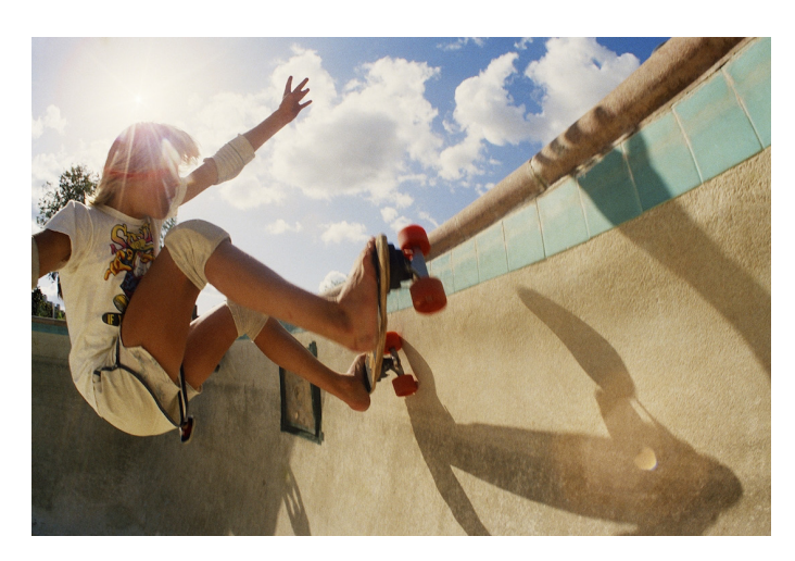
Team Line-Up (No. 60), 1970s