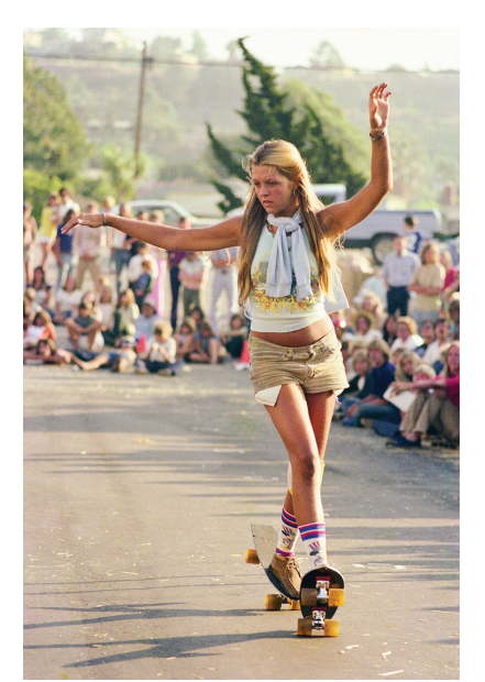
Del Mar Daffy, 1975